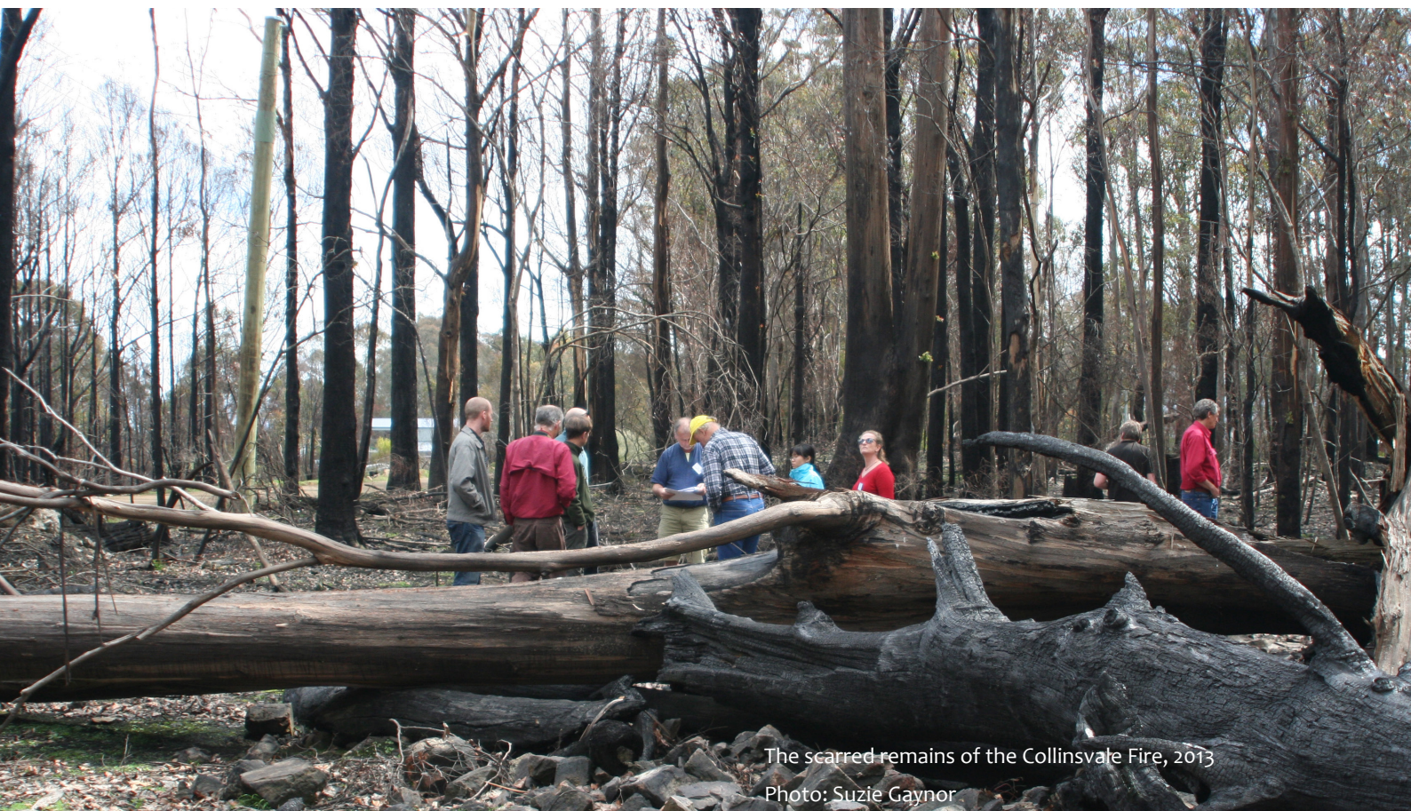
The scarred remains of the Collinsvale Fire, 2013