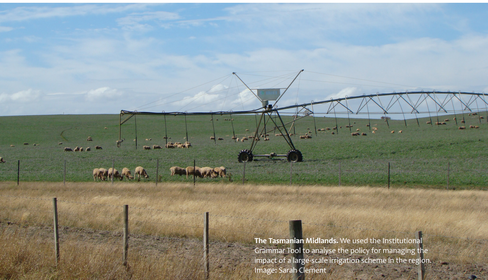
The Tasmanian Midlands. We used the Institutional Grammar Tool to analyse the policy for managing the impact of a large-scale irrigation scheme in the region.