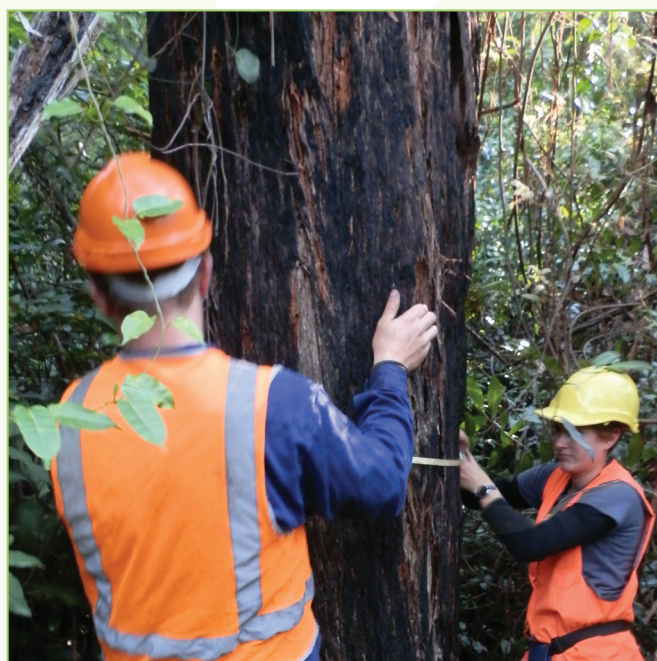
Tree growth and climate change: We compiled half a million measurements of growth in tree diameter.

As the climate warms, large trees will be affected more than small trees because they have proportionately less foliage for photosynthesis. And because their hydraulic system has to draw water further, to the top of the canopy, large trees are also especially vulnerable to drought stress, which is made worse by high temperatures.