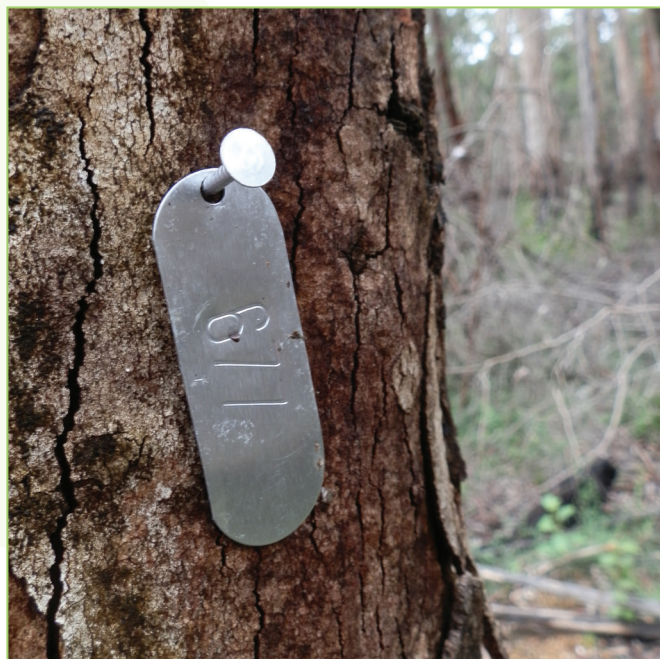
Slower tree growth: As growth rates drop, trees will recover more slowly from wildfire.